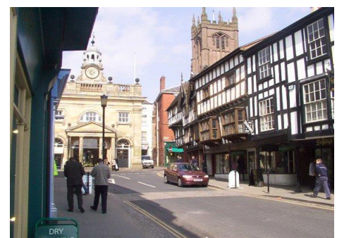
Leominster, Herefordshire @geograph.ord