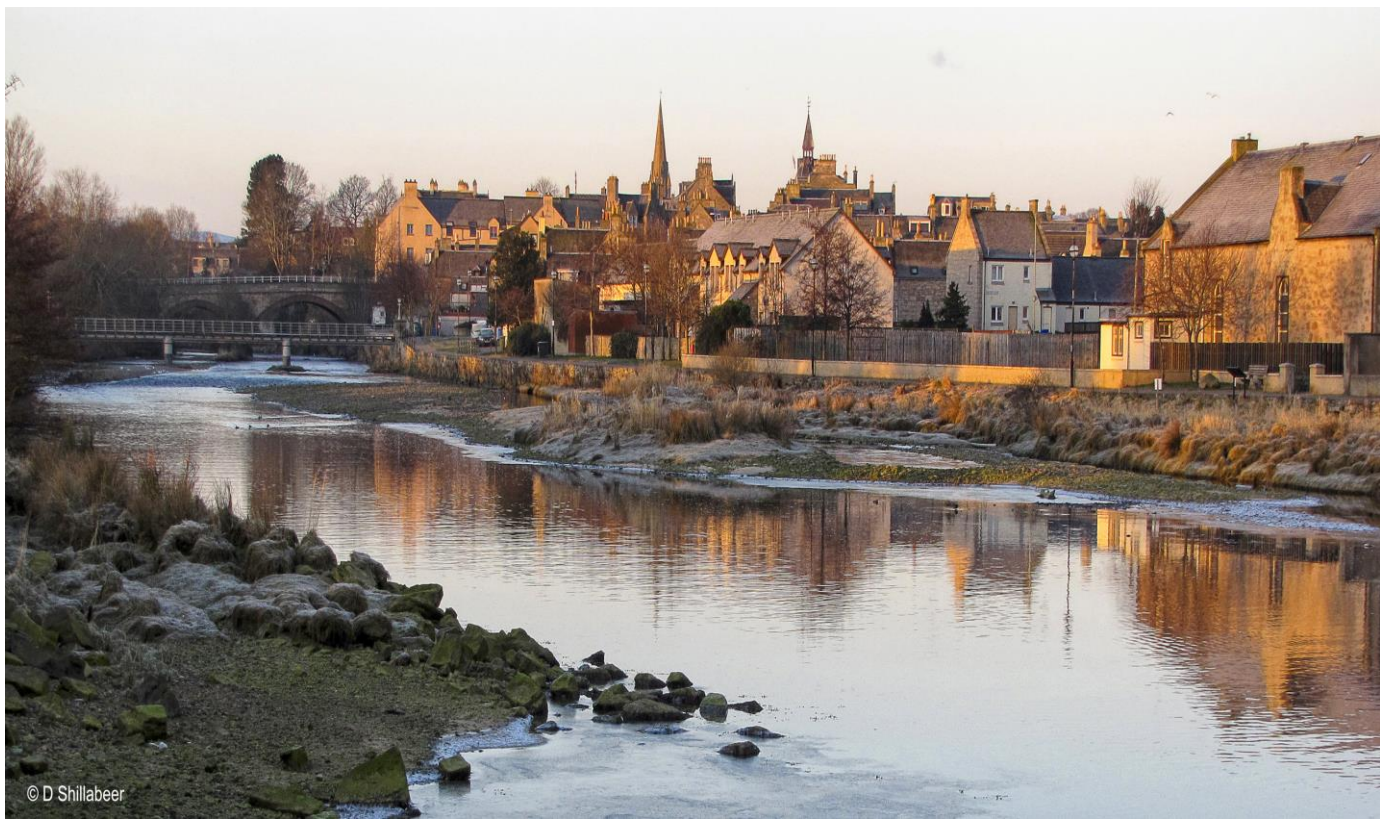
Nairn - small town in the Highlands, SCOTLAND Population 12,000 @ nairnscotland.co.uk D.Shillabeer

ECOVAST then looked at what small towns across Europe have been doing - using their assets to improve themselves. Many small towns have taken action with a wide range of projects to help them have a more secure economic future.