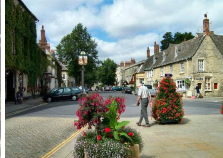
Romsey Hampshire