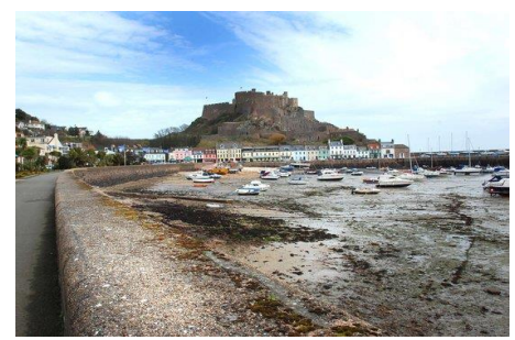
St Helier