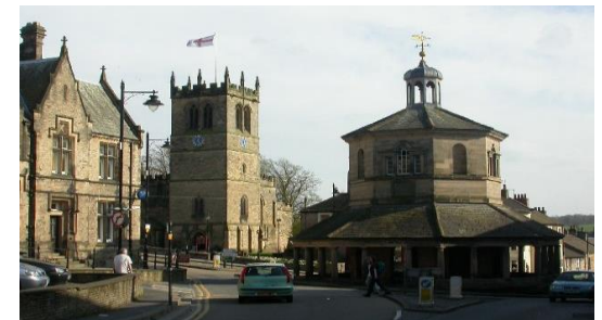
Loftus, Redcar