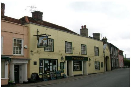
Manningtree, Essex