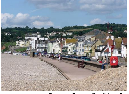
Waderidge, Cornwall