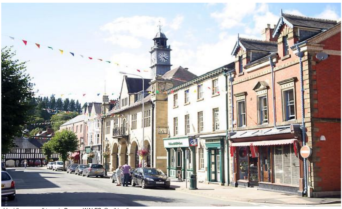
Llanidloes - small town in Powys, WALES

ECOVAST has developed its ideas about the importance of 'small towns' over many years.