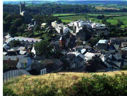
Armagh: © www.expedia