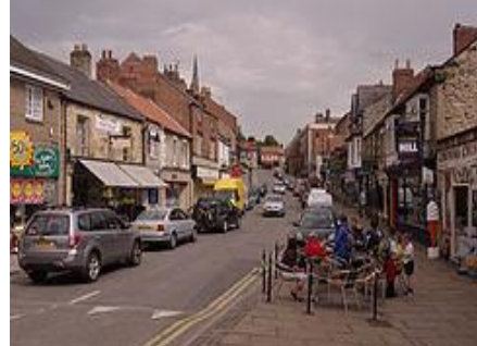
Hebden Bridge West Yorkshire