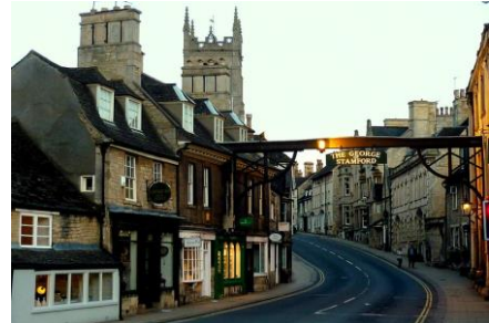
Ashbourne, Derbyshire