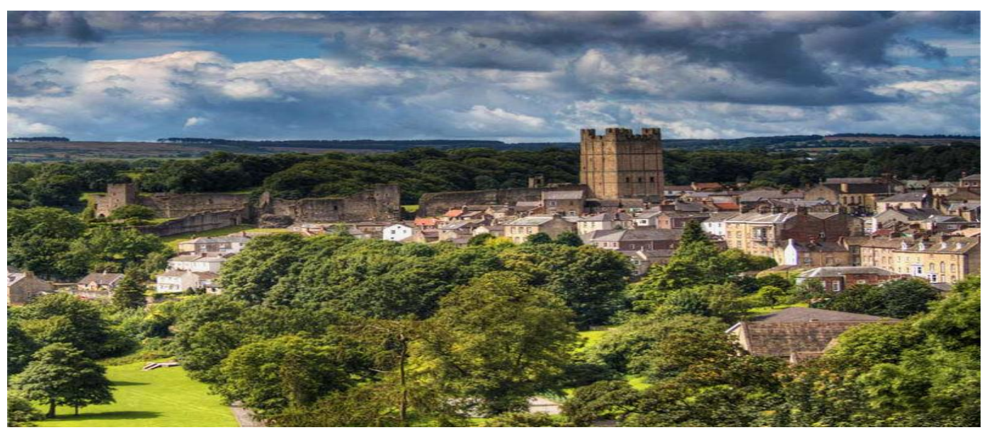
Richmond - small town in Yorkshire, ENGLAND Population 8,400

Towns are distinctive places which have an 'identity' – very dear to the people who live in them and call it 'home'. They reflect their history and local styles of architecture and building materials. Even towns that have been swallowed up into larger urban areas still act as centres to their 'local' population have a name and an identity.