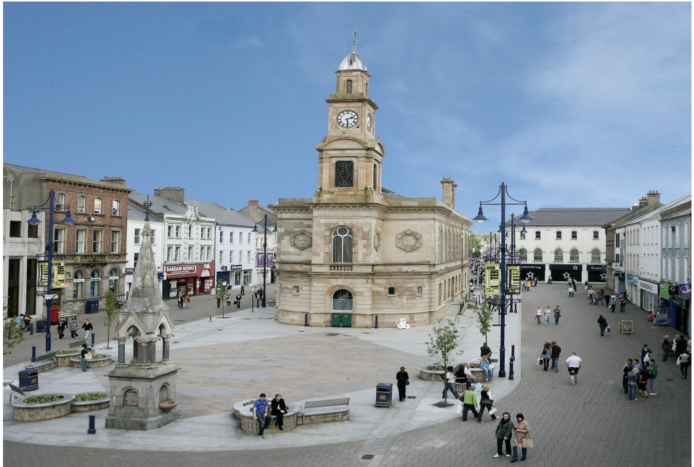
Coleraine - small town in Causeway Coast Glens Borough, NORTHERN IRELAND Population 24,600

ECOVAST considers that the information on small towns is not just relevant at the European level but to individual countries, regional and local authorities, business organisations and voluntary bodies, and they are aware that there is a lot of interest in small towns.