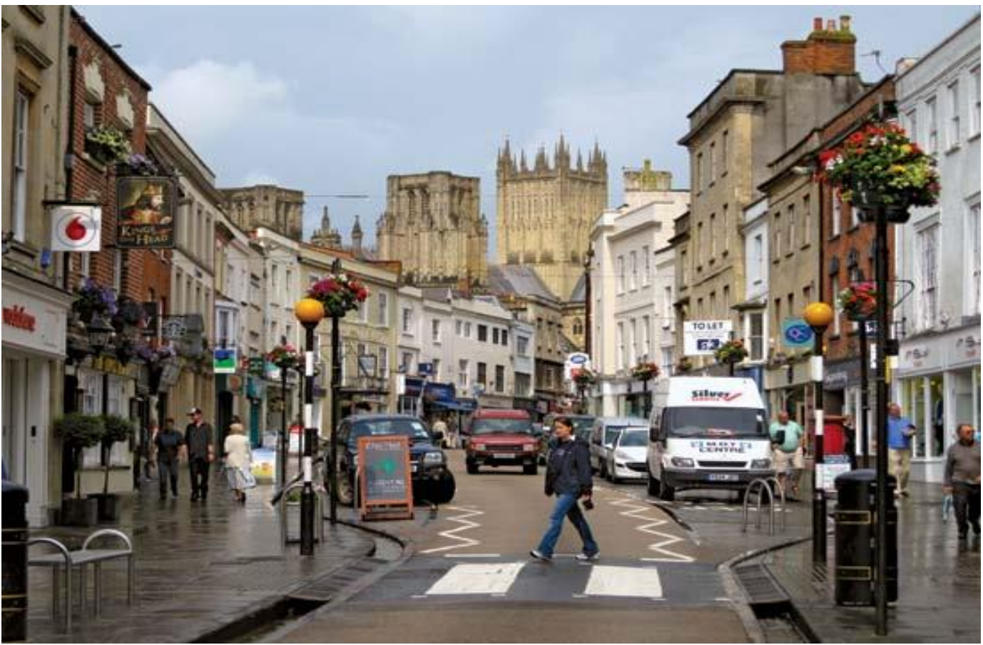
Wells - small town in Somerset, ENGLAND Population 10,500

The European Council for the Village and Small Town (ECOVAST) has been working for 30 years to promote the well-being of the people and heritage of the rural regions of Europe. It is primarily interested in small towns which play an important role as the 'backbone' of the rural areas that surround them.