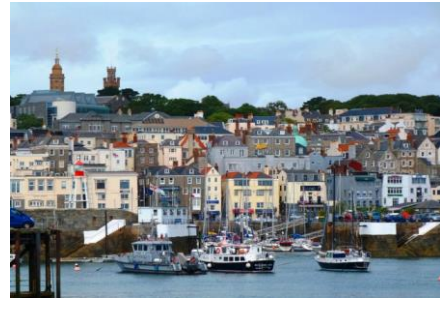
St Peter Port