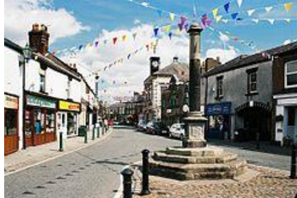
Frodsham, Cheshire